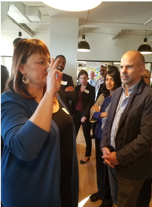
The event also featured “vote-with-your-feet” focused discussion and facilitated activities to capture participants’ challenges and opportunities for collaboration.