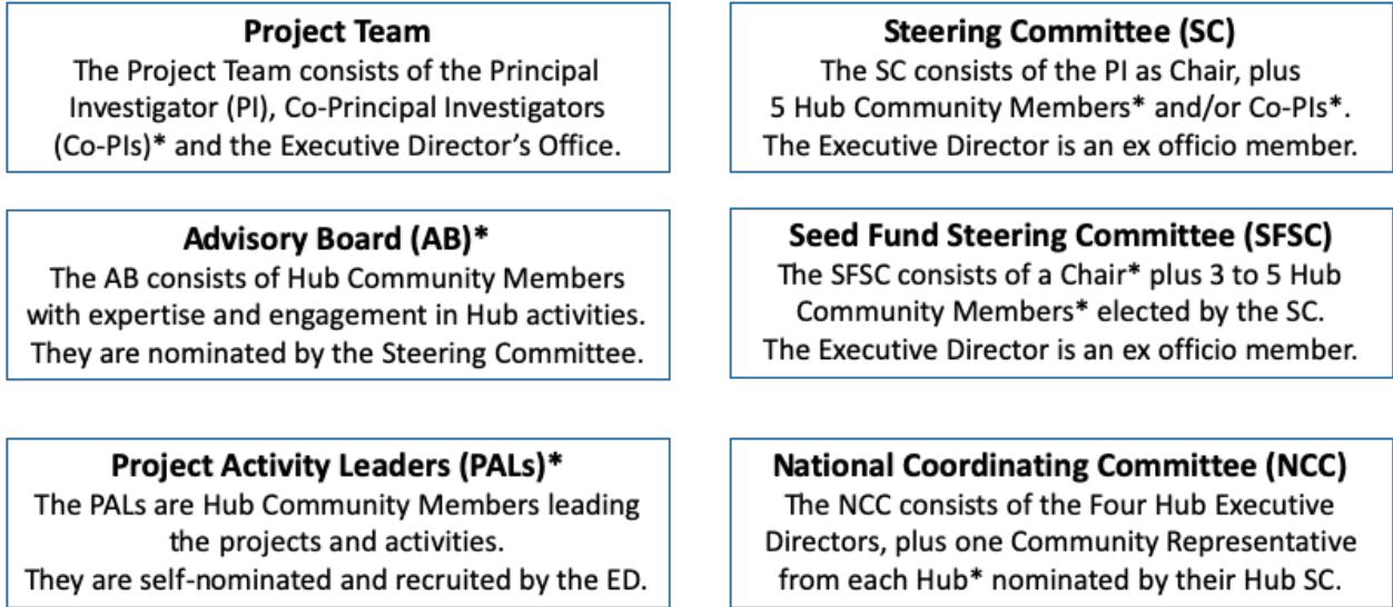
Figure 4: Northeast Big Data Innovation Hub Organization Chart