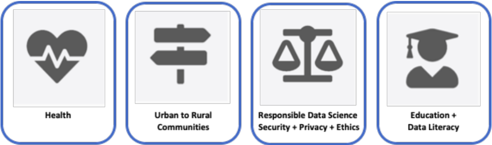
Figure 2: Northeast Big Data Innovation Hub Focus areas

In March 2020, a reassessment of the eight priority areas was conducted by the Northeast Hub leadership team including the PI, Interim ED, Steering Committee and Advisory Board, resulting in the streamlining of the eight priority areas to four focus areas (Figure 2). These four focus areas were chosen to build on the Hub’s current strengths, activities, and regional distinctions. Streamlining to four focus areas enables the Northeast Hub team to filter project activities and align resources to enable progress and maximize value and positive impact for the community.